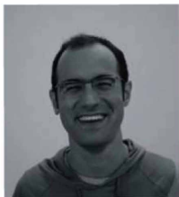
New Adam – woolly thinker

The Big Knit was the brainchild of a man called New Adam. We thought he was completely nuts, but given that we've raised over £1 million to help keep older people warm during winter since it started, we were delighted to be proved wrong.